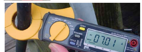
Top: An inexpensive circuit tester. Bottom: This clamp meter shows a 7-amp difference between the current going into the boat and coming out.